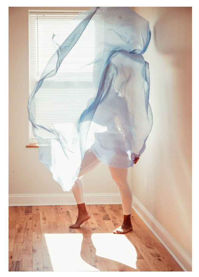
Dance of Light 2019

As a chaser of light, my work is centered around observing the dance between shadow and light. Shadow adds depth. A deeper story. In this series, the veil represents the space between those worlds (light and shadow). Within the images the shadows represent the unknown stories of the black woman. The dance women, black women in particular, gracefully perform to survive and the work that often goes unnoticed and taken for granted.