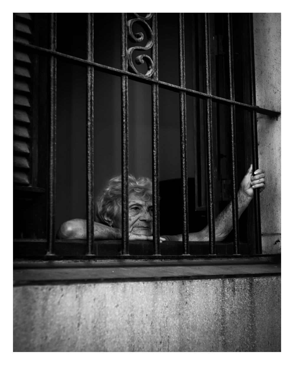
Bar None Cuba, 2018