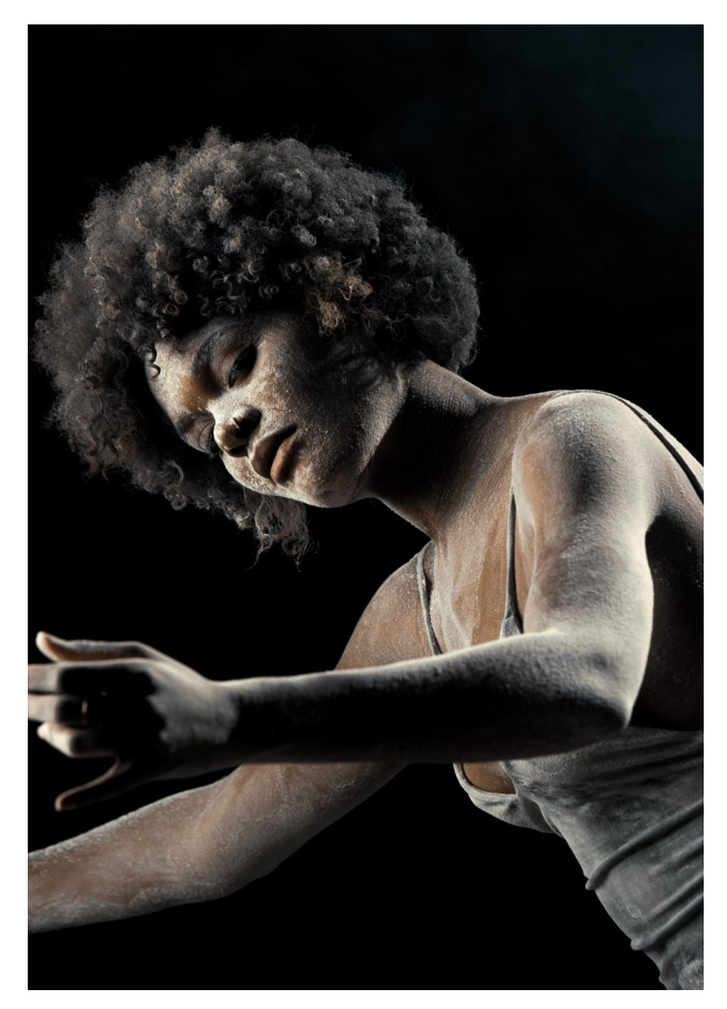
From the Ashes 2019

As human beings we embody both. This is my interpretation of such exuberance through the vessel of a woman.